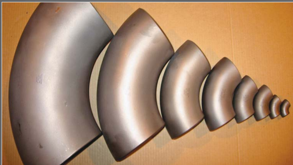
Zirconium fittings are among the many product lines United Titanium, Inc. manufactures and supplies.