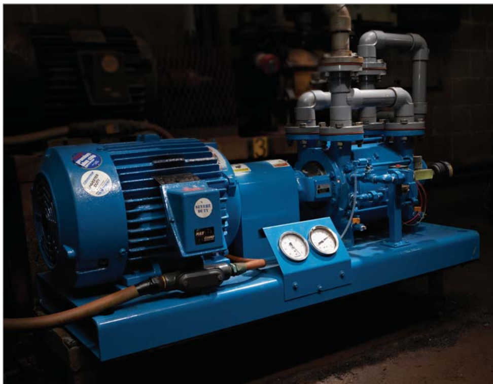
SIHI manufactured this corrosion resistant zirconium vacuum pump to withstand acid and temperature spikes in ATI Wah Chang’s challenging sponge-making process.

SIHI also simplified the pump in the process. “Typically when we get into these types of special metallurgy and special designs, we steer away from that two-stage design due to the complexities of the liquid ring vacuum pump design,” according to Karas. “We recommend a single-stage design, which