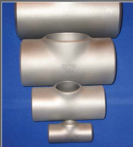
United Titanium, Inc. makes a range of precision fasteners of a wide variety of alloys.

For more details about United Titanium products and services, please visit www.unitedtitanium.com . ✨