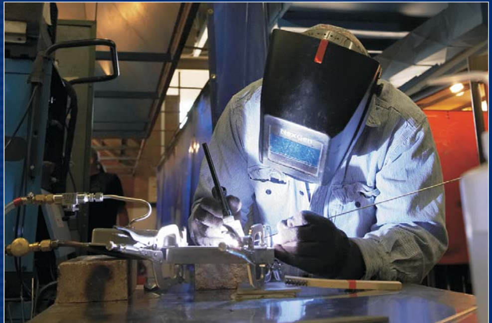
An example of the GTAW process (gas tungsten arc welding) during ATI Wah Chang's Annual Welding Seminar.

Generally, reactive and refractory metals are formable, can be cut and welded, and like other metals, they have a wide variety of bend radius limits. It is important to understand these constraints for each alloy before starting any forming operations. When forming a particularly complex shaped part or a piece that has a tight bend radius, the use of heat to warm the part will greatly enhance its movement. Just be aware of the 425°C temperature ceiling. If processing requires temperatures greater than 425°C, subsequent cleanup may be necessary to remove absorbed atmospheric surface contaminants. These metals can be formed dry in a press break or forge, for example, and can also be drawn into shapes with forming dies. The use of drawing or dry film lubricants will help reduce the tendency to damage the metal surface.