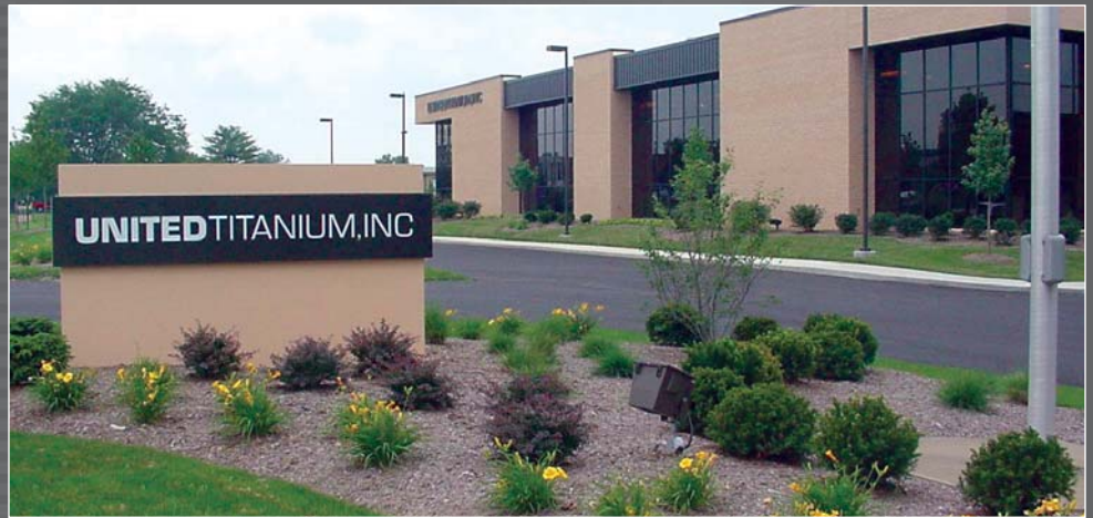
United Titanium Inc. has a modern facility measuring 132,000 square feet. It houses fastener manufacturing as well as the service center.

Zirconium is ductile and has useful mechanical properties similar to those of titanium and austenitic stainless steel. Zirconium also has excellent resistance to many corrosive media, including superheated water, and is transparent to thermal energy