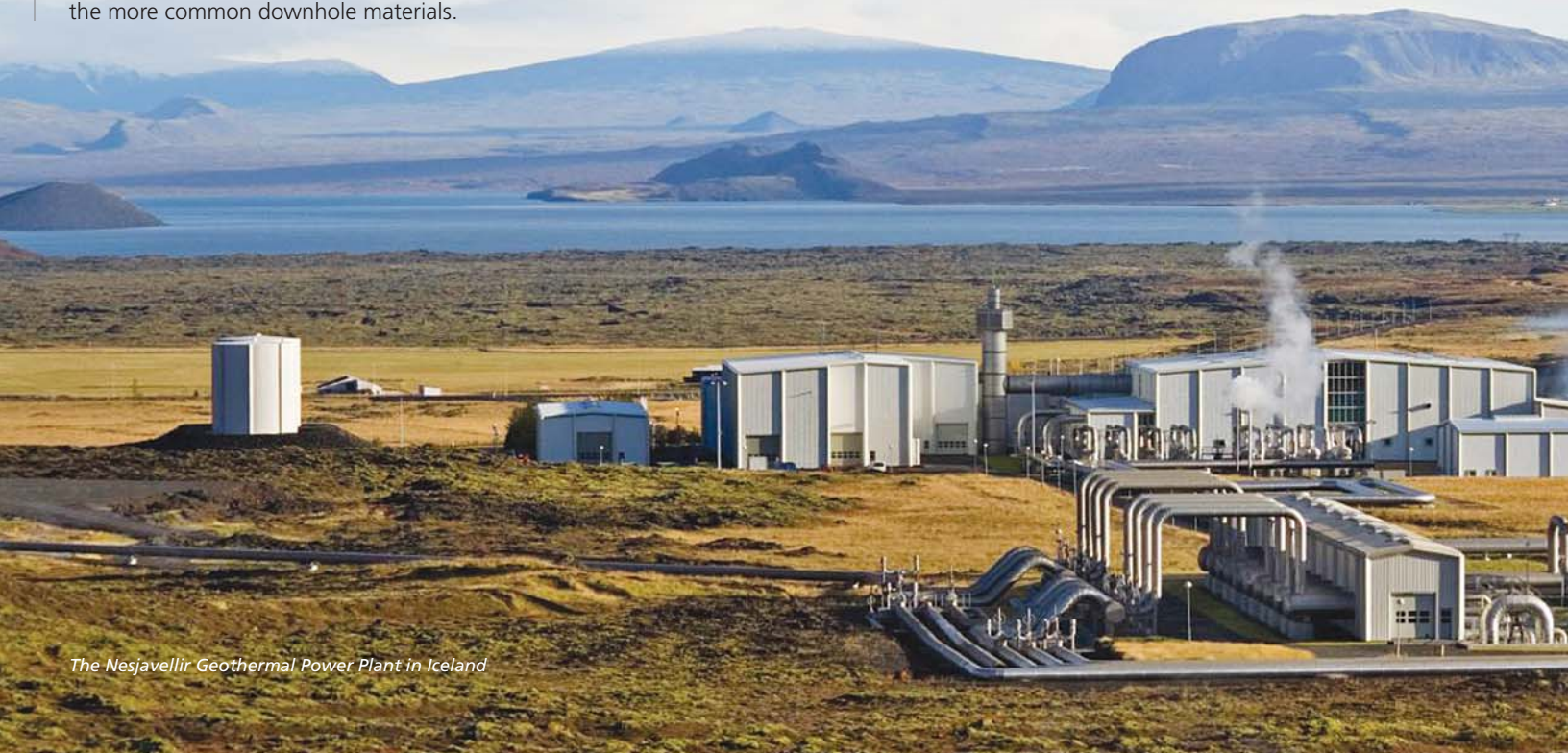
The Nesjavellir Geothermal Power Plant in Iceland

When it comes to materials used in nuclear power production, zirconium gets most of the credit. However, there are areas in the process where titanium is used, such as the steam turbine condenser (typically Ti Grade 2). In some nuclear applications, Ti Grade 2 does not provide sufficient corrosion resistance. One such case is drip shields used in spent fuel repositories.