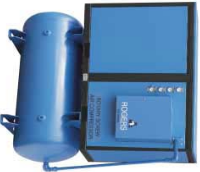
Model MG50, tank mounted assembly